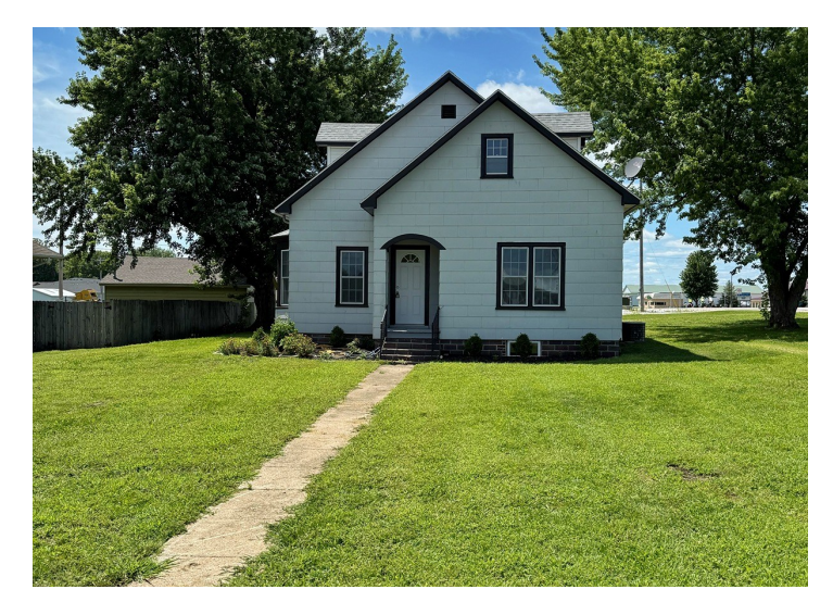
Broker does not guarantee the accuracy of sq. ft., lot size, or other information, buyer is advised to independently verify the accuracy of information through personal inspection and with appropriate professionals