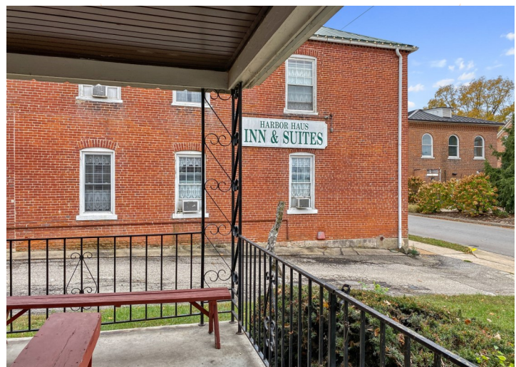
Broker does not guarantee the accuracy of sq. ft., lot size, or other information, buyer is advised to independently verify the accuracy of information through personal inspection and with appropriate professionals