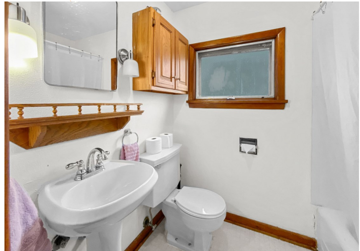
Broker does not guarantee the accuracy of sq. ft., lot size, or other information, buyer is advised to independently verify the accuracy of information through personal inspection and with appropriate professionals