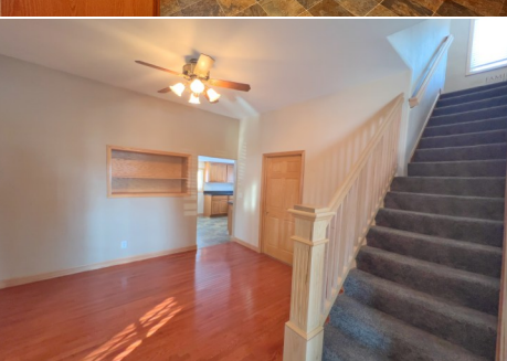
ADDRESS: 400 Head Street, Churdan, IA 50050