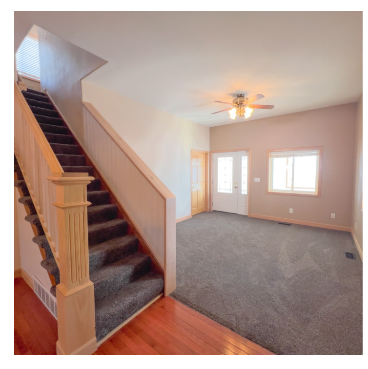
Broker does not guarantee the accuracy of sq. ft., lot size, or other information, buyer is advised to independently verify the accuracy of information through personal inspection and with appropriate professionals