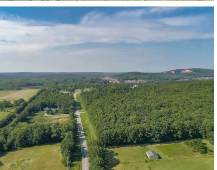
BIDDING ENDS Wednesday, September 20th @ 10:00AM BID NOW at www.Trophypa.com