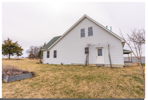
ADDRESS: 8734 Pike 475, Curryville, MO 63339

SCHOOLS DIST: Bowling Green R-I BEDROOMS: 2