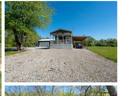
BIDDING ENDS FRIDAY, JUNE 16<sup>th</sup> at 10:00 AM See Full Terms & Conditions at www.trophypa.com

PROPERTY ADDRESS: 59 Pond Bottom Rd. Middletown, MO 63359